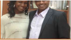
A Special Day at the Office: An ENP intern from the Israel By Design program meets former MK Shlomo Molla