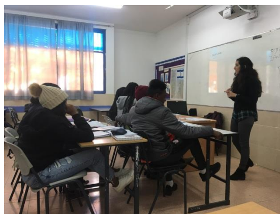
SPACE Beer Sheva students at Makif Rabin studying for their History winter matriculation exam