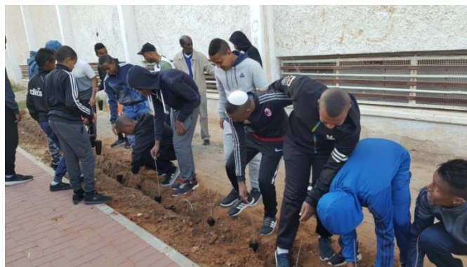
Ramle Youth Outreach Center participants plant trees outside the center for Tu B'Shevat