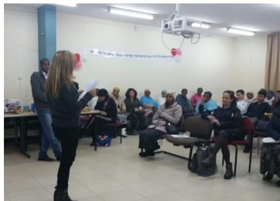
SPACE introductory meeting for parents in Kiryat Yam