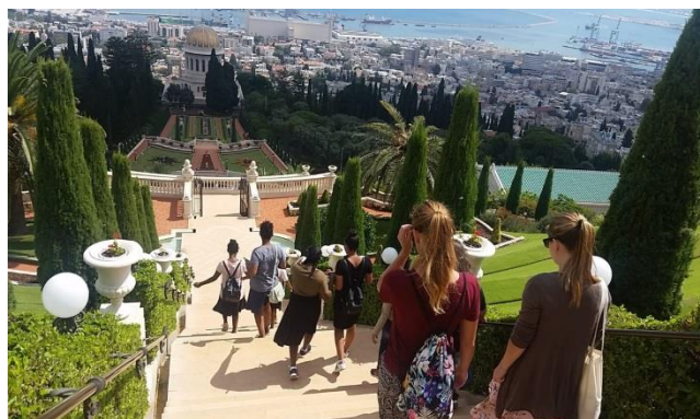
ENP Bridges Participants Tour Bahai Gardens... in English!!!