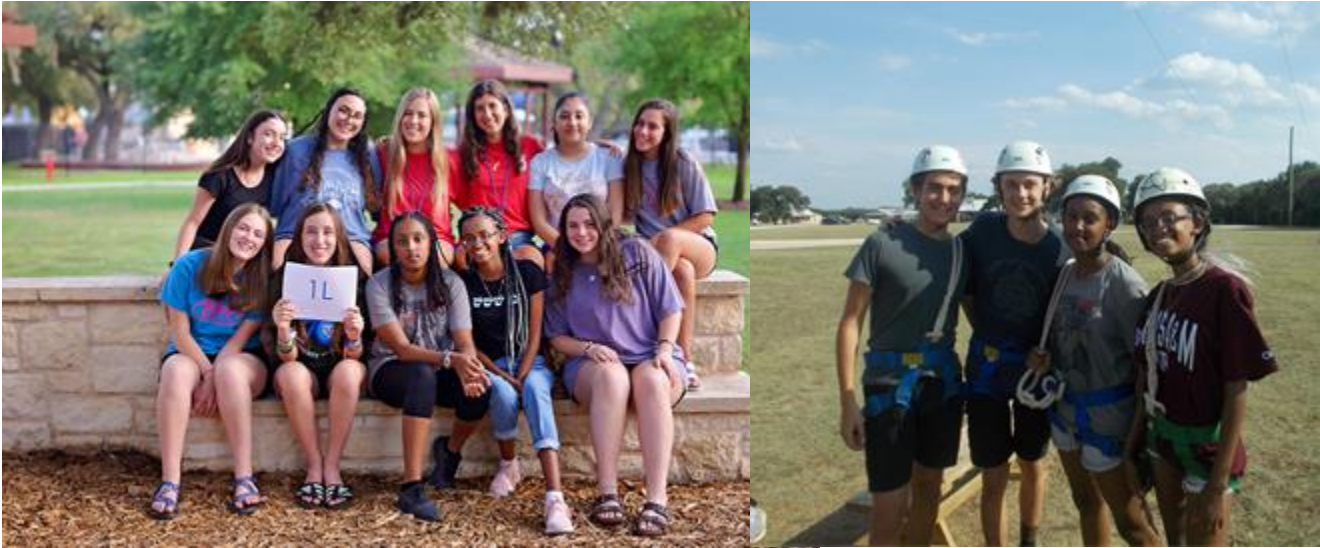
Where Partnering Started: Camp Young Judea in Texas