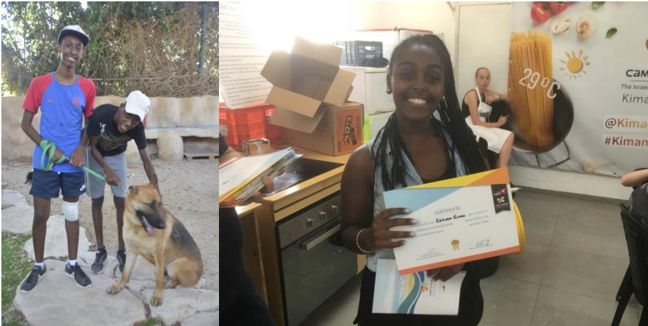
Kimama in Israel Offered Exceptional English Immersion... without Going Abroad