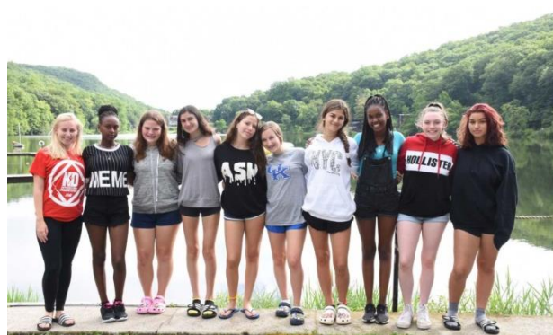
ENP Bridges Participants with their campmates at Camp Surprise Lake in New York

ENP launched the pilot “ENP Bridges” program in 2017-18, thanks to the generosity of the Jewish Federation of Greater Houston. The primary goal of ENP Bridges is to encourage ENP SPACE (School Performance and Community Empowerment) participants to use, and improve, their spoken English, with the ultimate objective to enable the high school ninth graders to place in the highest tracking levels of English upon their entrance to tenth grade—literally, the key to college entrance. Regrettably, too few Ethiopian-Israelis are placed in the tracks that enable eligibility for university placement.